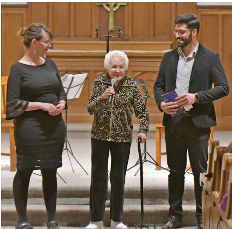
Lucile Evans Music Festival