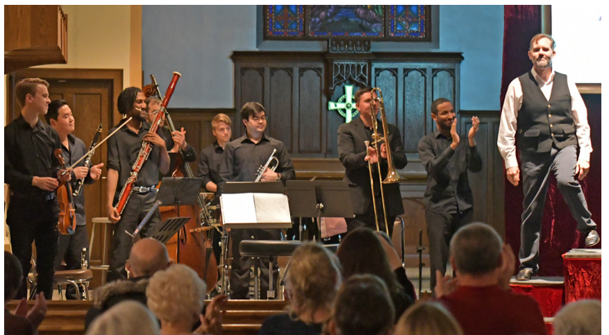
The Soldier's Tale