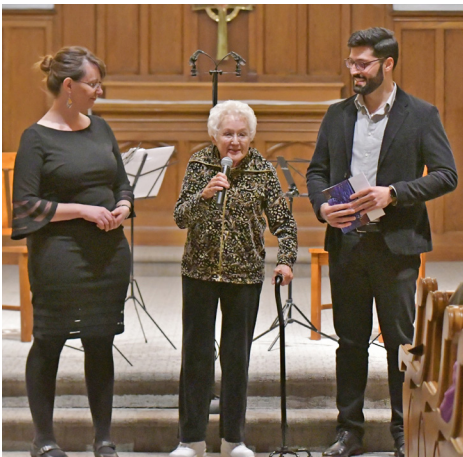
Lucile Evans Music Festival